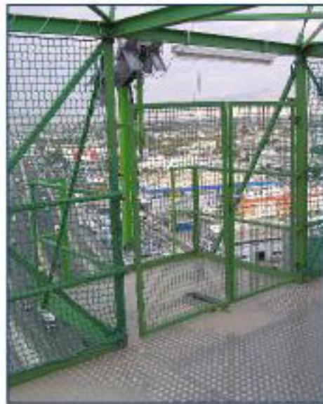
Launch ramp gate