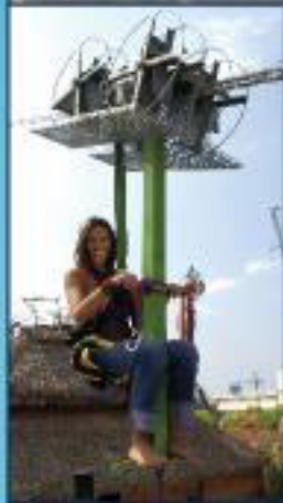
Rider wagon (carries up to 3 riders)