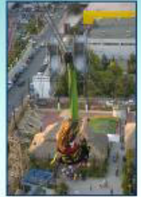
View from launch ramp