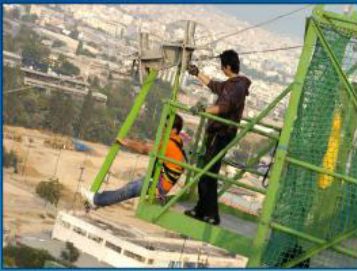
Rider leaving launch ramp