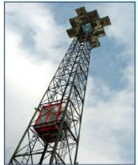
Elevator in transit