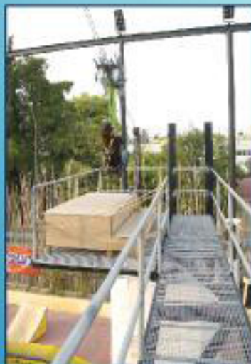
Elevated landing station